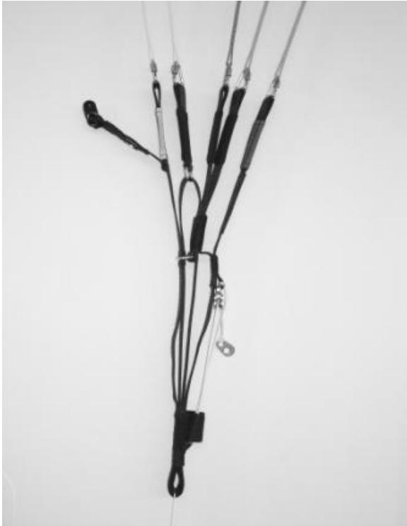
Risers not accelerated